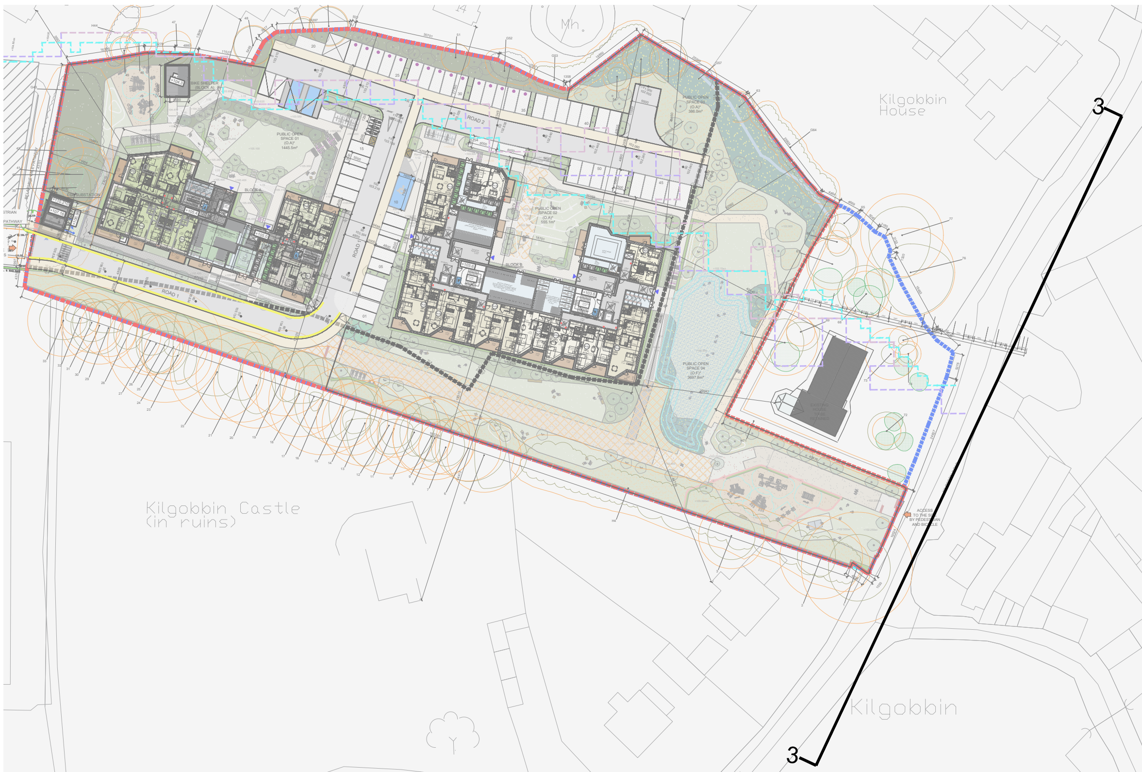
KEY PLAN PROPOSED SITE PLAN NTS