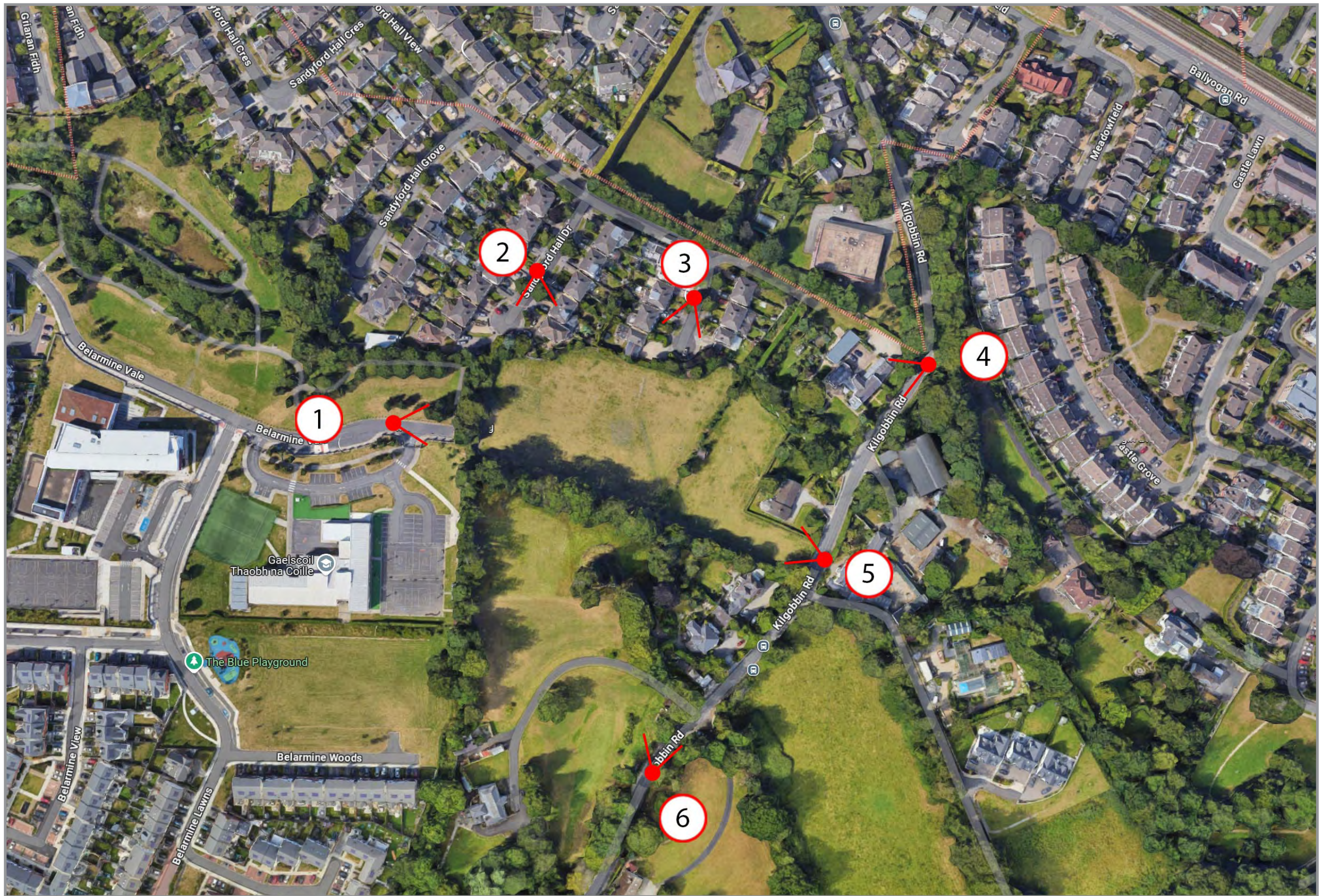
View Location Map

This map is for view location purposes only. Please refer to Architects drawings for site layout and redline boundary.