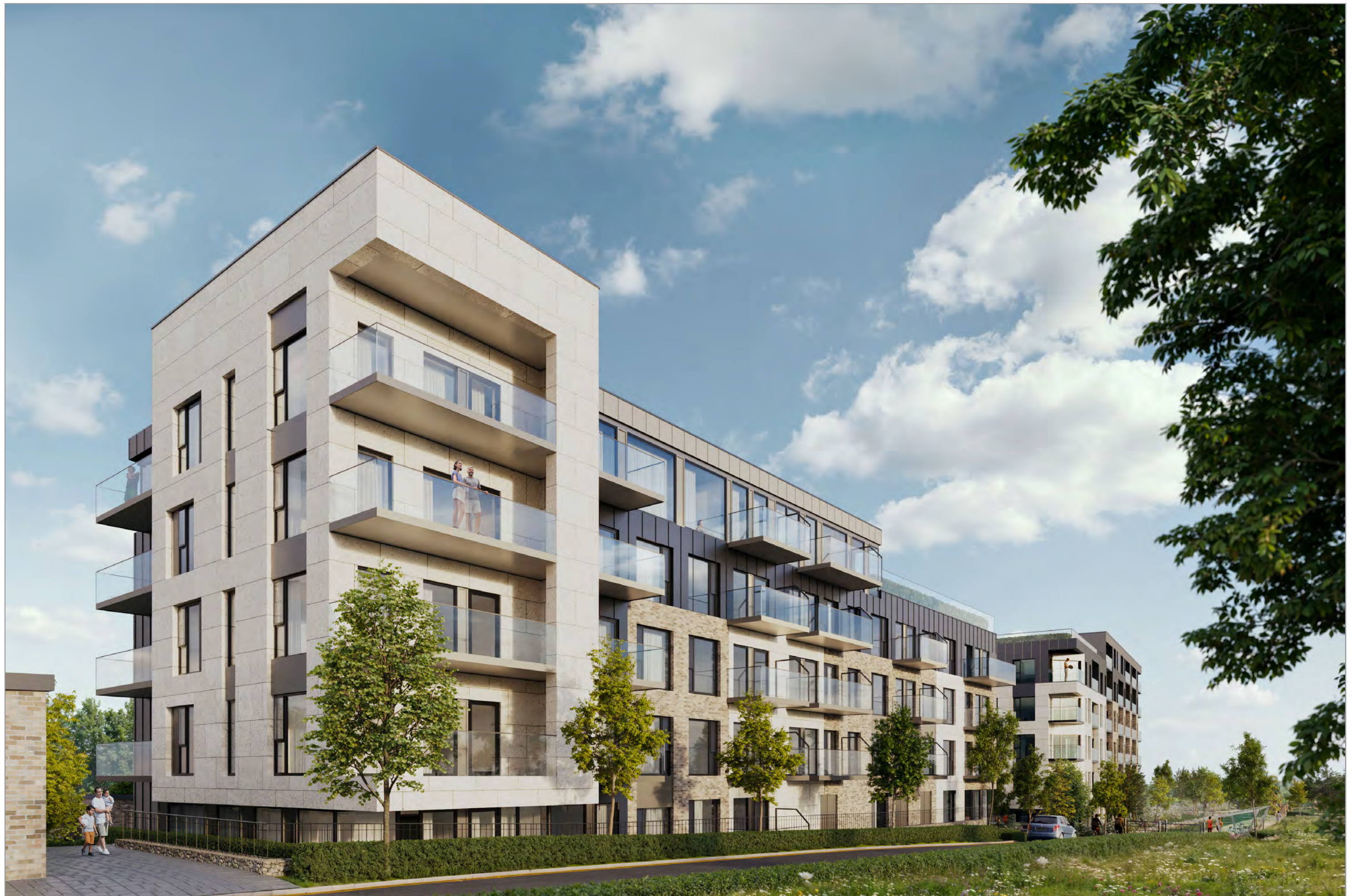
Location CGI 01