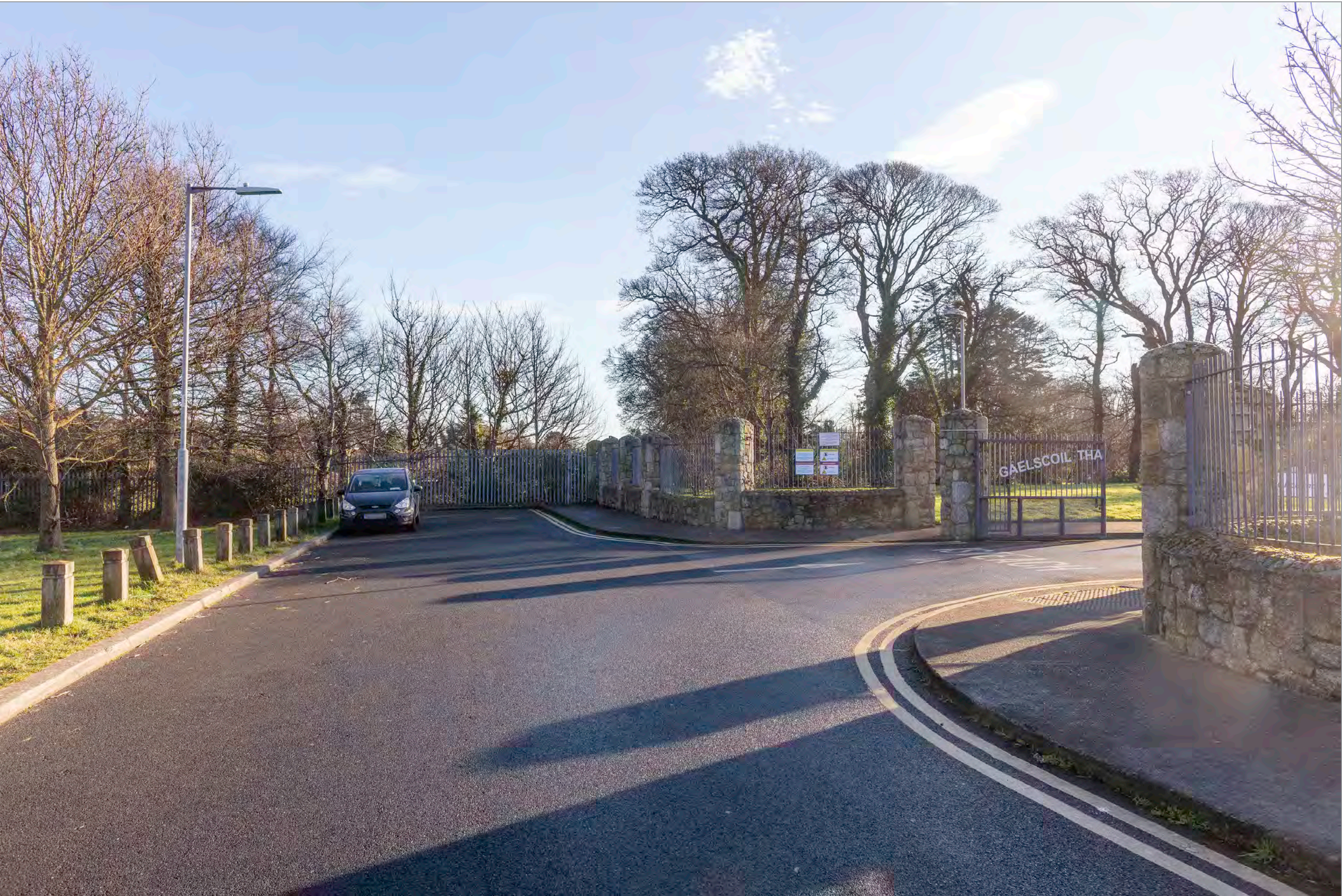
< 24mm / 73.7° < 35mm / 54.4° < 50mm / 39.6° Lens Information: Focal Length / Field of View 50mm / 39.6° > 35mm / 54.4° > 24mm / 73.7° >