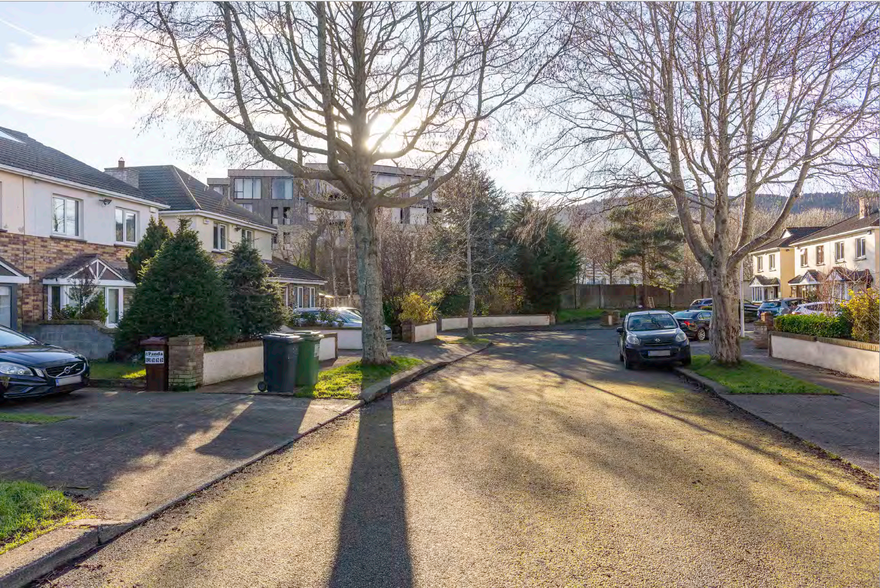
< 24mm / 73.7° < 35mm / 54.4° < 50mm / 39.6° Lens Information: Focal Length / Field of View 50mm / 39.6° > 35mm / 54.4° > 24mm / 73.7° >