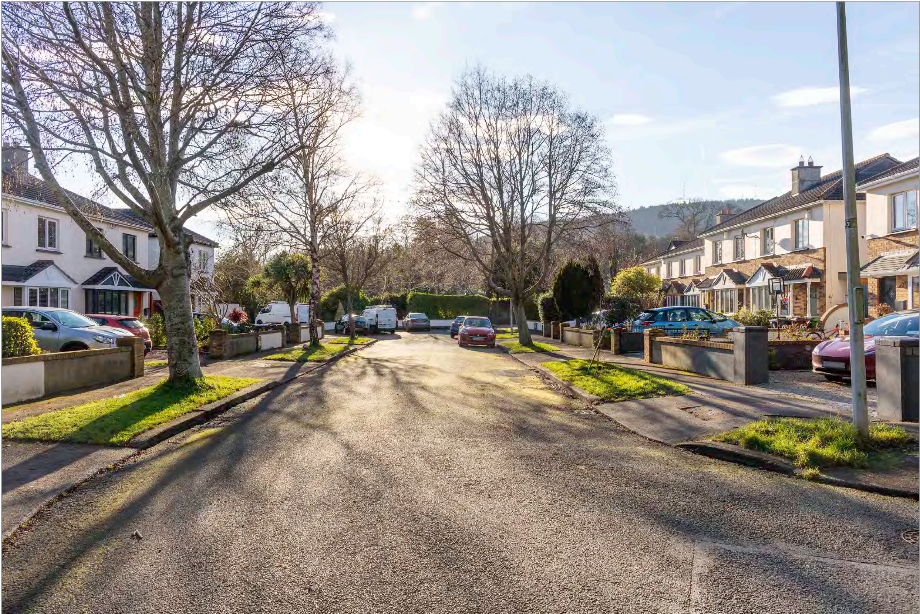
< 24mm / 73.7° < 35mm / 54.4° < 50mm / 39.6° Lens Information: Focal Length / Field of View 50mm / 39.6° > 35mm / 54.4° > 24mm / 73.7° >